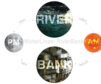
(right) Diagram highlighting the cyclical relationship between the river and the bank.